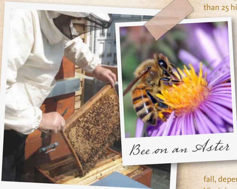
Bee on an Aster

To find additional information or learn more about us, be sure to visit us at our website: www.pwrbeekeepers.com